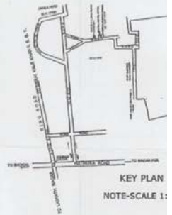
KEY PLAN NOTE-SCALE 1: