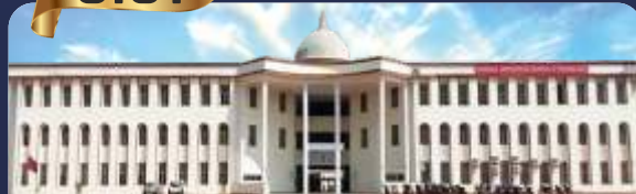
ORIENTAL INSTITUTE OF SCIENCE & TECHNOLOGY, JABALPUR