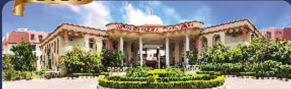
ORIENTAL INSTITUTE OF SCIENCE & TECHNOLOGY, BHOPAL