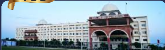
THE ORIENTAL SCHOOL BHOPAL