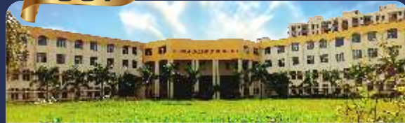
ORIENTAL COLLEGE OF TECHNOLOGY, BHOPAL