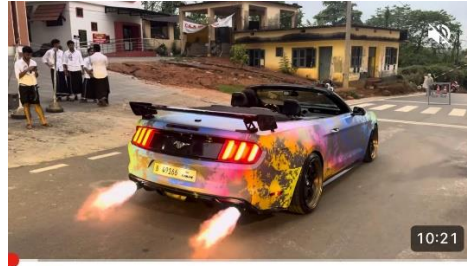
Manjeri Medical College Auto Show 🤩 Moto Vlogger · 91K views · 12 days ago

16. In the order dated 25.08.2023 in SSCR No.20 of 2021 this Court noticed the specific stand taken by the Deputy Solicitor General of India, on instructions, that vehicles fitted with exhaust system emitting fumes and loud sound , wide tyres protruding out of wheel arches/mudguards , etc. cannot be permitted to be used in public place, posing a potential threat to the safety of its passengers and other road users. In case any such violations are noticed, the Enforcement Wing of the Motor Vehicles Department and the Police can proceed against the owner/driver of the said vehicle. Based on the aforesaid stand taken by the Deputy Solicitor General of India, on behalf of the Ministry of Road Transport and Highways, this Court by the order dated 25.08.2023 in SSCR No.20 of 2021 ordered that it is for the police and the Enforcement