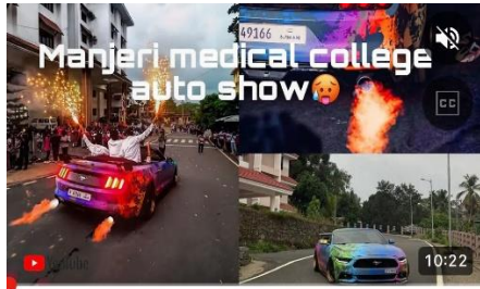
Manjeri Medical College Auto Show 🤩 Moto Vlogger · 91K views · 12 days ago