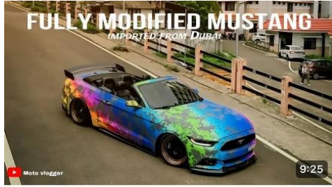
Dubai ൽ നിന്നും ഹാക്കെത്തിയ Fully Modified Mustang 🤩 Moto Vlogger · 111K views · 8 days ago