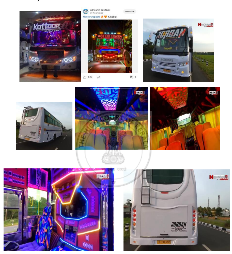
The contract carriages by name 'Kottoor' with registration No.KL-03/AE-6605, 'Oneness' with registration No.KL-32/B-2774 and 'Jordan' with registration No.KL-29/E-6225 seen in the screenshots reproduced hereinbefore are fitted with unauthorised after-market multi-coloured LED/laser/neon lights/flashlights, etc., which are cable of dazzling the drivers of the oncoming vehicles, pedestrians and other road users. The promotion video of the contract carriage

of such altered vehicles which were reproduced in paragraph 27 of that order are available at paragraph 4 of this order at page Nos.5 and 6. A few screenshots taken from the videos posted in YouTube of vehicles with extensive modifications, posing threat to the safety of the public, are reproduced hereunder;