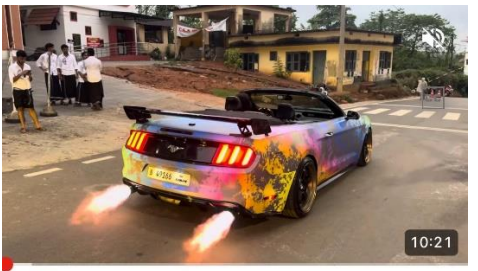
Manjeri Medical College Auto Show :